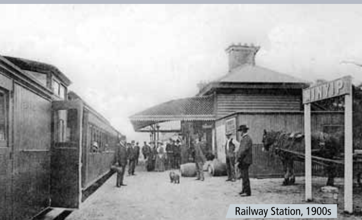
Railway Station, 1900s