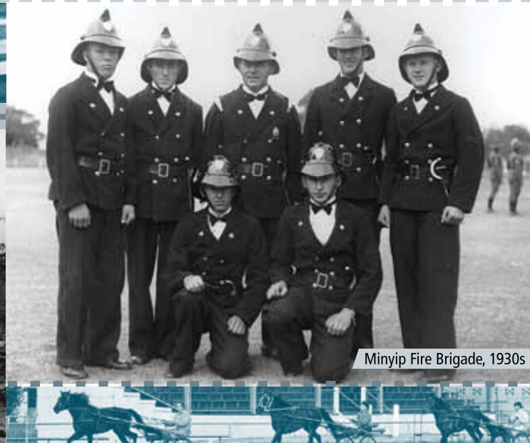
Minyip Fire Brigade, 1930s